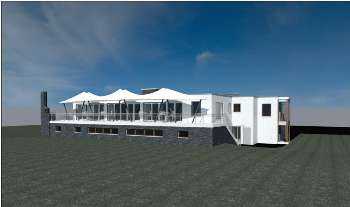
Rear Elevation (view from first's floodlight pitch)