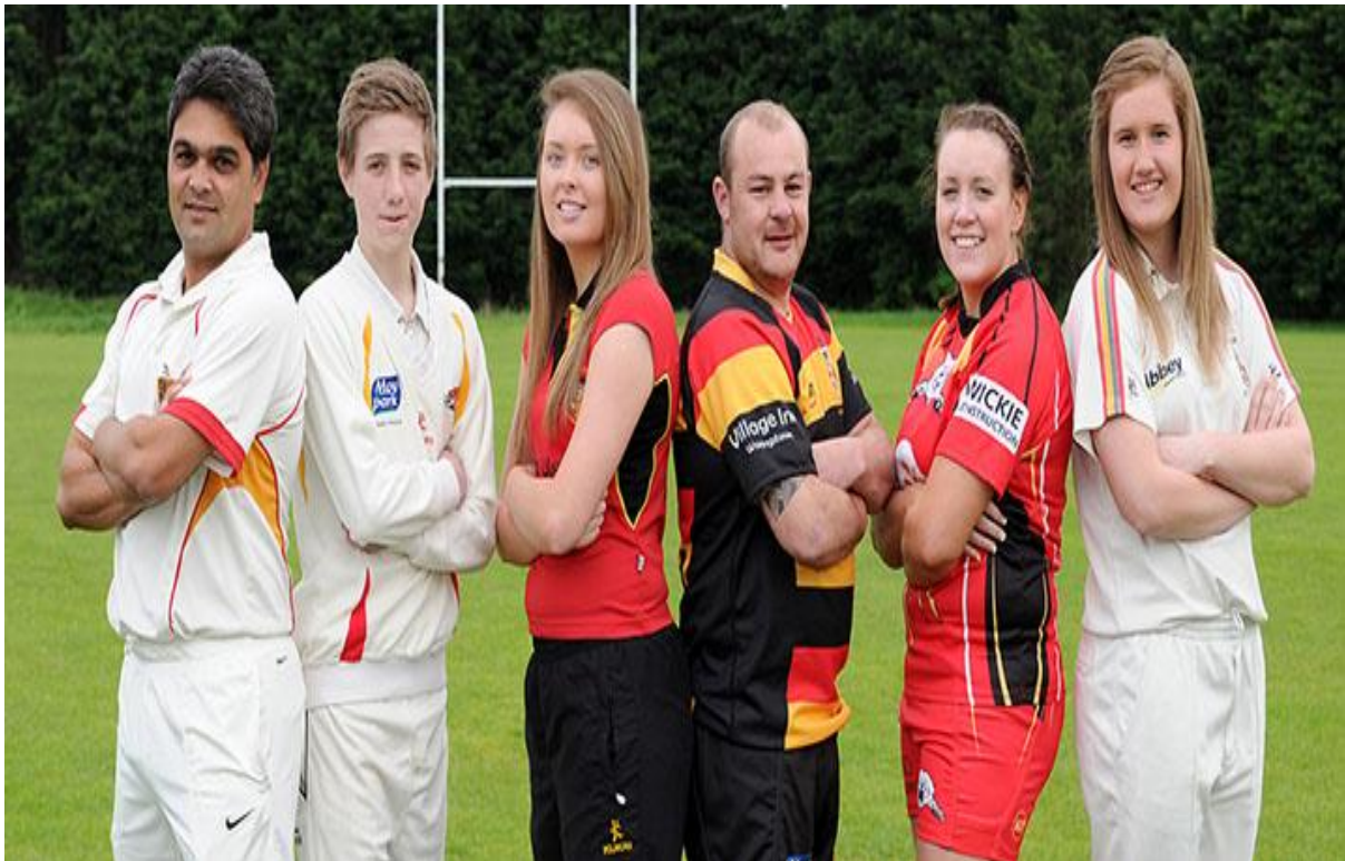
Chairman of Cricket Ireland

He was instrumental in overseeing Ireland become a first-tier cricket nation as confirmed in June 2017