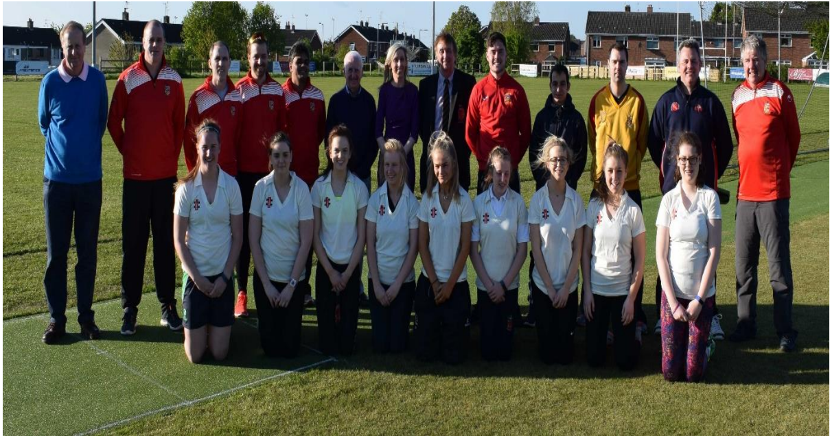
Players and officials pictured at the opening of the new international standard artificial wickets at Pollock Park