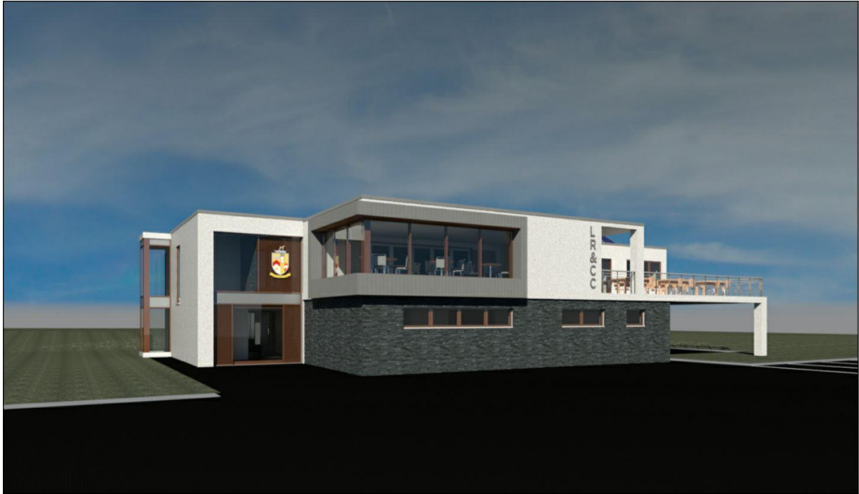
Front Elevation (view from car park)

Images of what our redeveloped Club house will look like when completed: