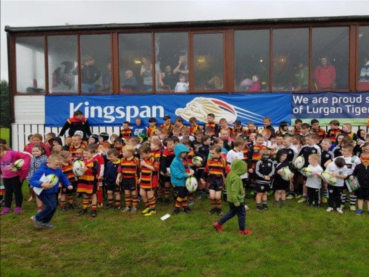
P6 Youth from Eire Og GAA and Lurgan Tigers who have been involved in home and away fixtures