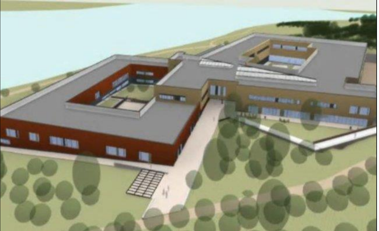
Images of the new SRC College which will replace Craigavon Senior High in the Centre of Lurgan